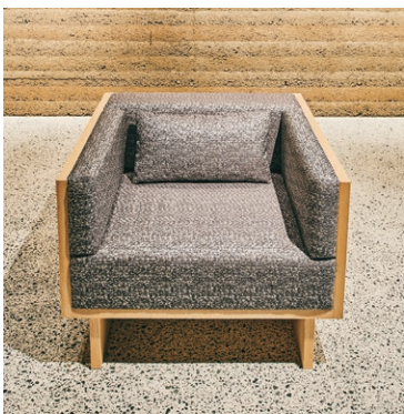
Lounge Chair “Blink” 590,000 Yen (63,720 Yen Incl. Tax)