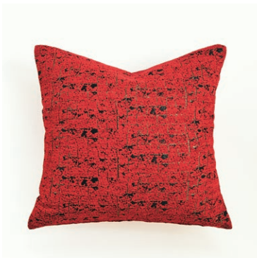
Cushion “New York” 32,000 Yen (35,640 Yen Incl. Tax)

In the HOSOO FLAGSHIP STORE, home collections including furniture, cushions and room shoes made with our textiles are available. Please enjoy the ultimate craftsmanship made possible only by the skills of expert artisans, in the comfort of your home.