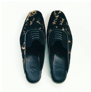
Room Shoes “Frosted Petals” 70,000 Yen (75,600 Yen Incl. Tax)