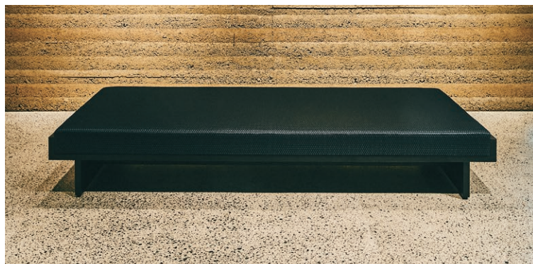
Day Bed “Luster” 460,000 Yen (496,800 Yen Incl. Tax)