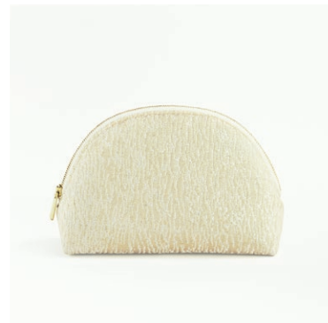
Pouch Half-moon “Bubbles” 21,000 Yen (22,680 Yen Incl. Tax)